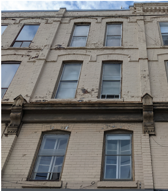
Remnant wood cornice on Building A marks the top of the original retail bays, now located at the top of the second-storey (ERA, 2021).