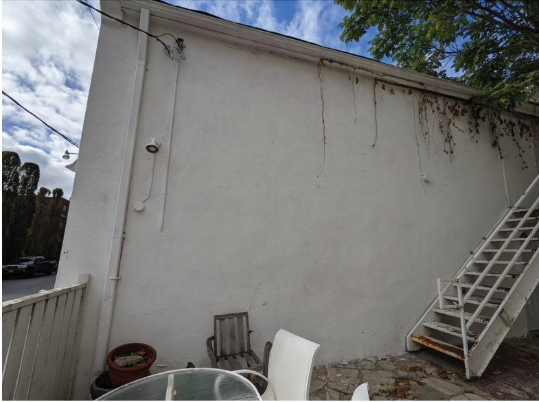
East elevation of Building C (ERA, 2021).