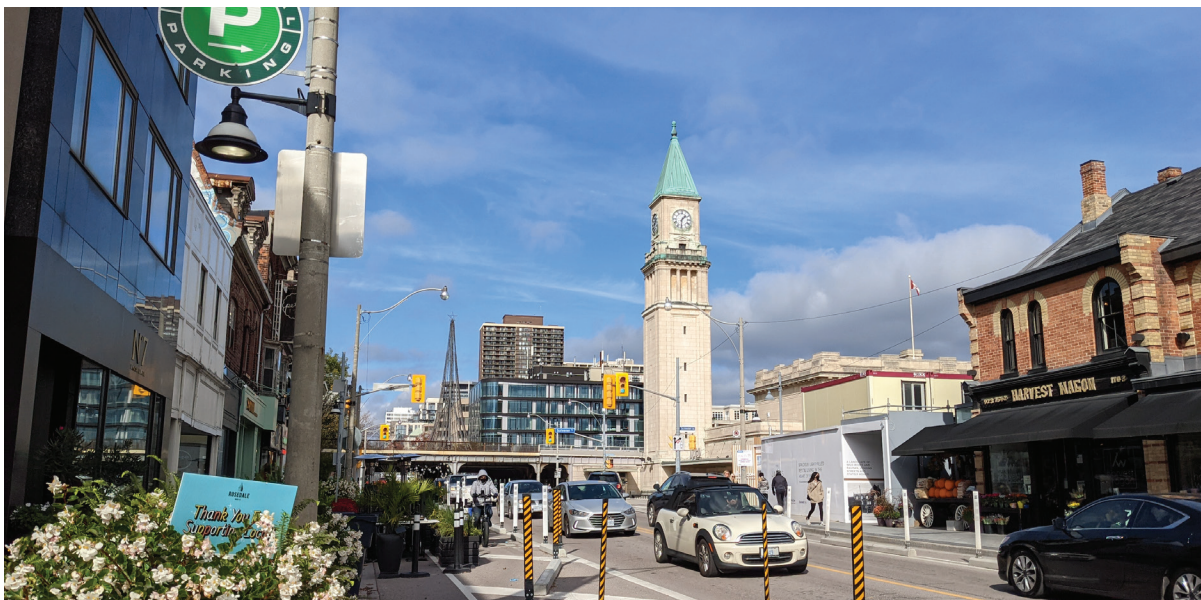
Looking northeast from the west side of Yonge Street north of Marlborough Avenue (ERA, 2021).