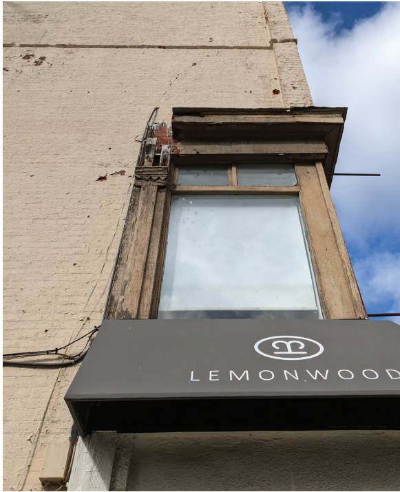
Remnant cornice on building A marking the top of the original retail bays, and the floating corner shop window with replacement glazing convey the historic grade line (ERA, 2021).