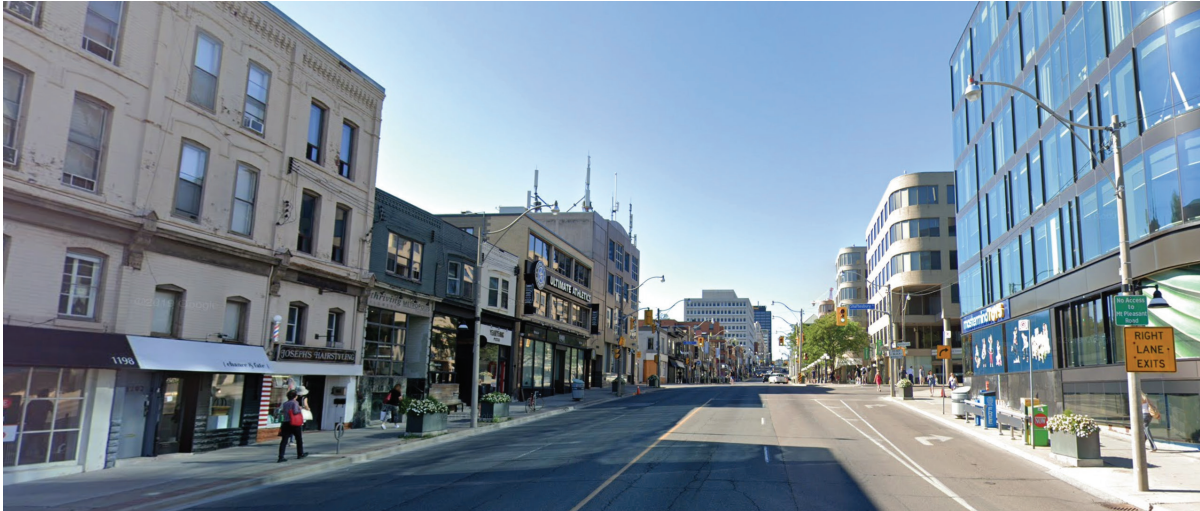
Looking north up Yonge Street toward Shaftesbury Avenue.