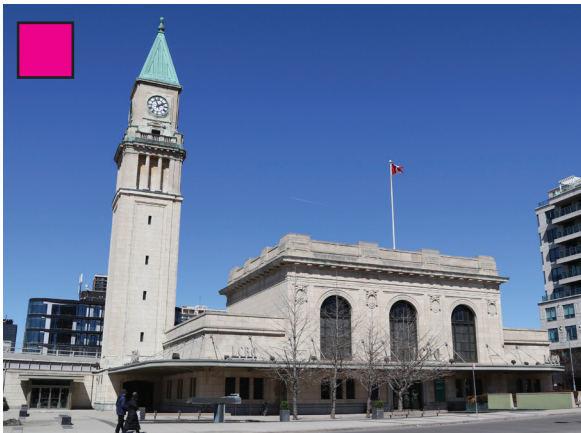
2-storey stone Beaux Arts building and clock down, designed by Darling and Pearson in 1915-16 for use as the CPR North Toronto Station.