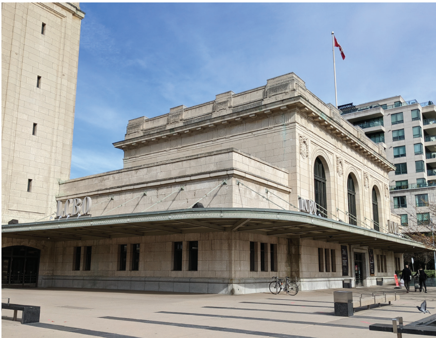
Southwest elevation of 1121 Yonge Street (ERA, 2021).