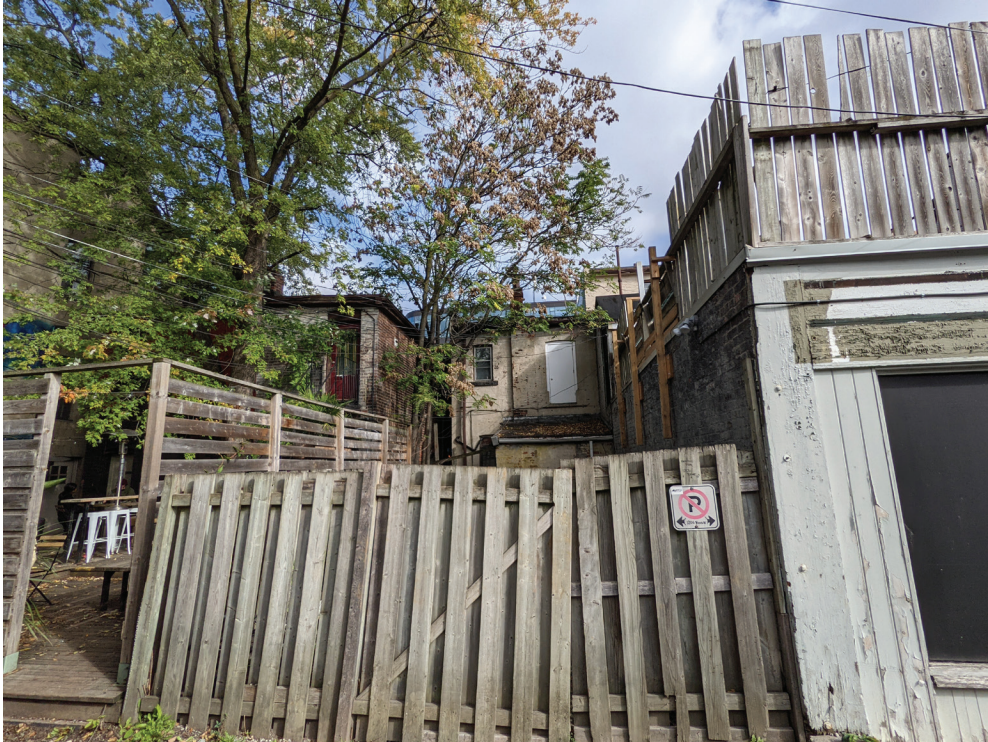
West (rear) elevation of Building A (ERA, 2021).