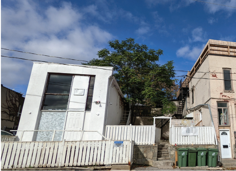
South elevation of Building C (ERA, 2021).