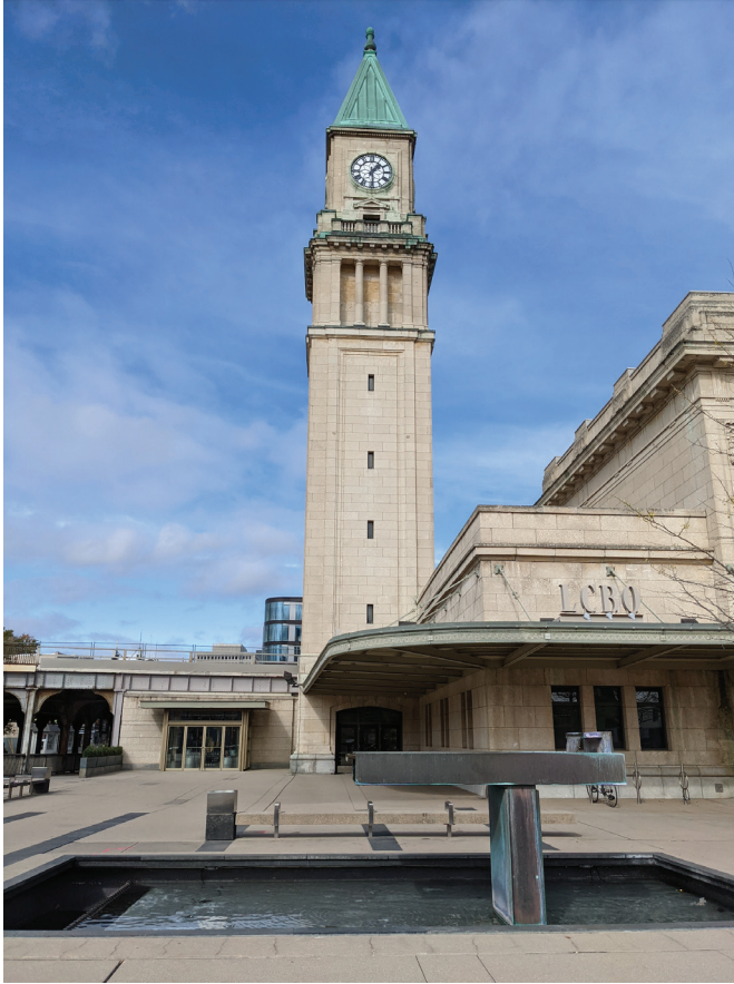
West elevation of 1121 Yonge Street with clock tower, and integration with CPR corridor and bridge (ERA, 2021).