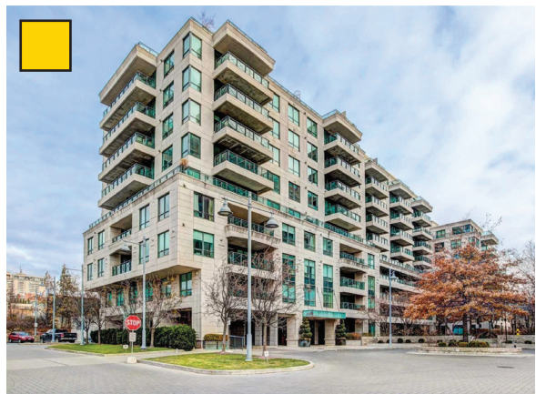
10-12 storey contemporary residential building, constructed in 2004.