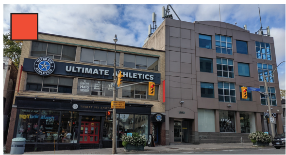
3-4 storey commercial buildings north of the Site, constructed in mid-century modern (left) and post-modernist (right) styles in the mid-to-late 20th century.