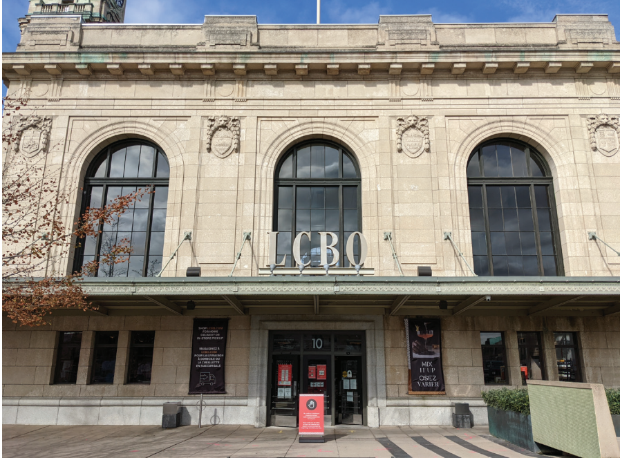
South elevation of 1121 Yonge Street (ERA, 2021).