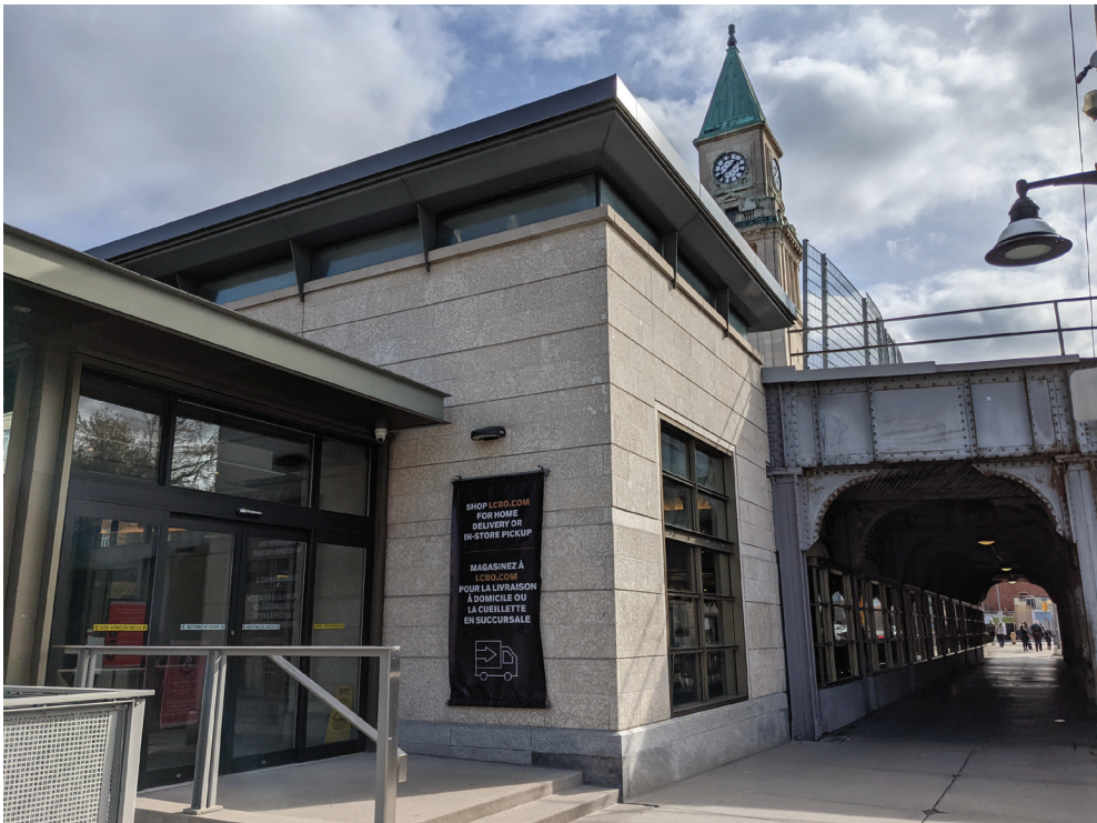
North contemporary addition entrance of 1121 Yonge Street, with steel bridge and raised sidewalk on the east side of Yonge Street (ERA, 2021).