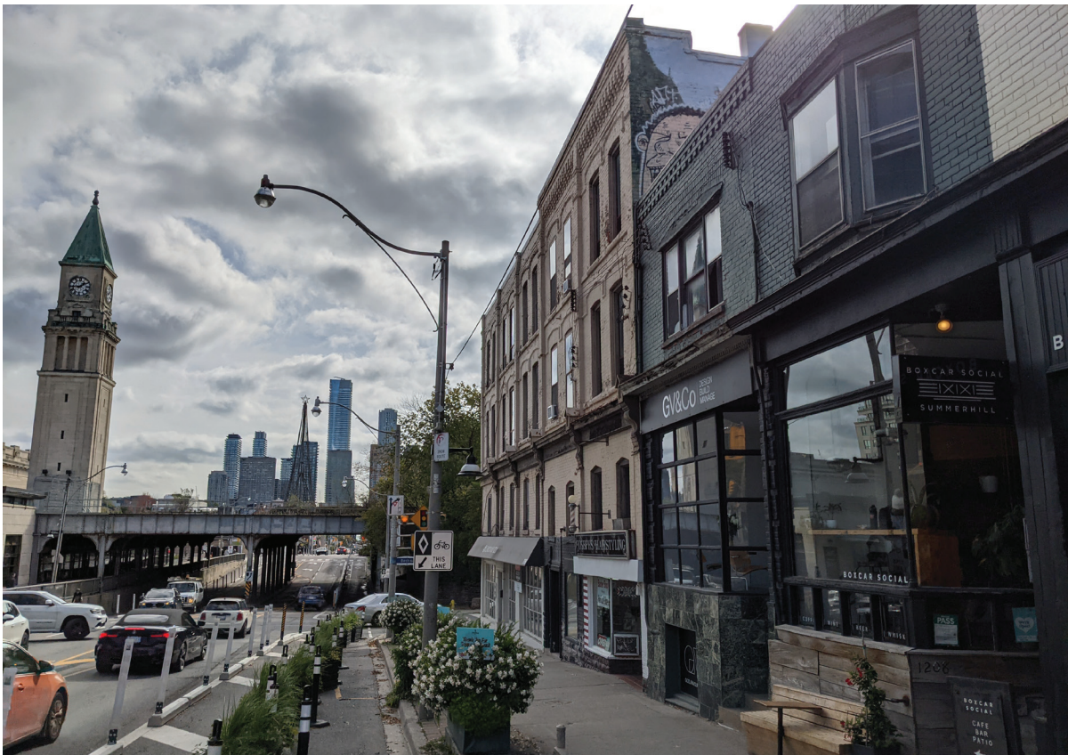
Looking south from the west side of Yonge Street by Building B (ERA, 2021).