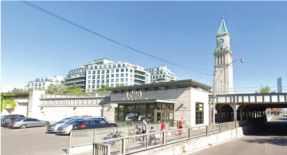
North elevation of 1121 Yonge Street, contemporary addition adjacent from the Site. Clock tower and steel bridge seen in photo.