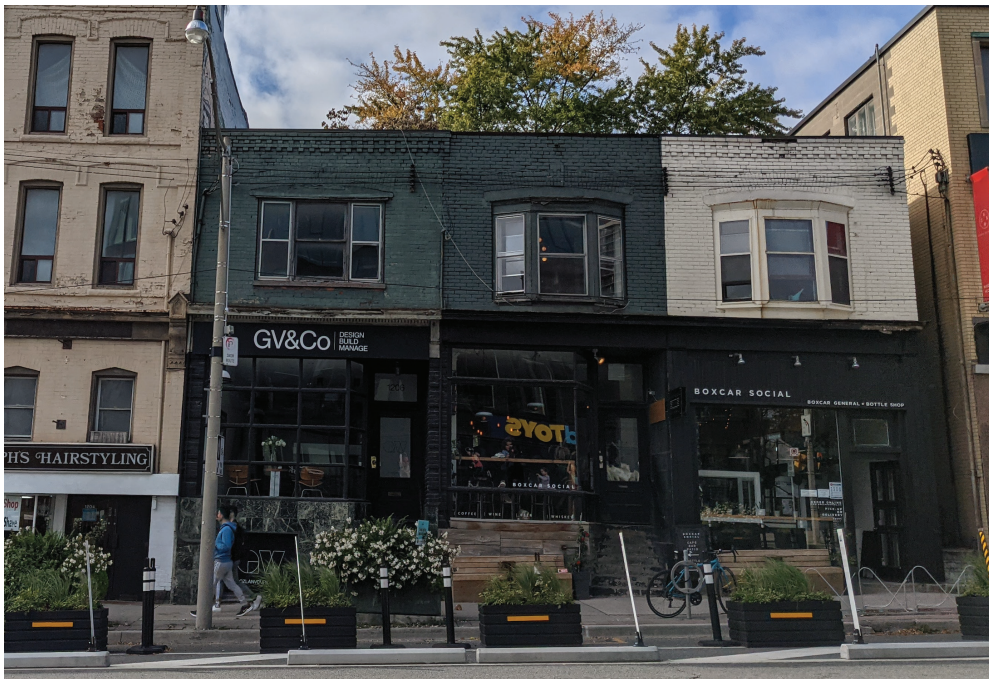
East (principal) elevation of Building B (ERA, 2021).