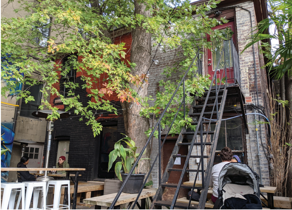
West (rear) elevation of Building B (ERA, 2021).