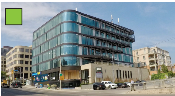
6-storey post-modernist office building constructed c. 1986, and reclad in 2016 for office and retail use.