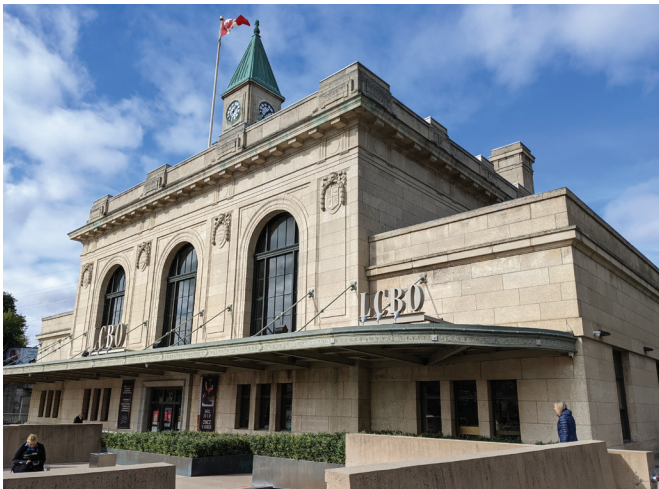
South and part of the east elevation of 1121 Yonge Street (ERA, 2021).