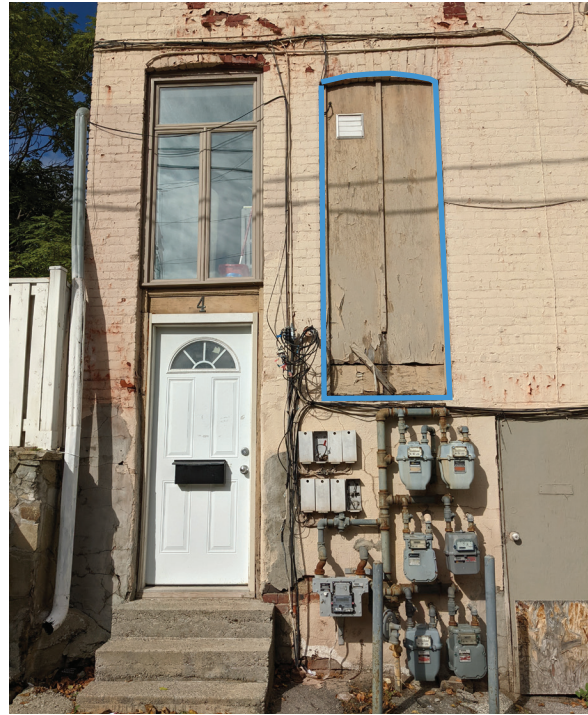
The original side door on Building A (outlined in blue) that floats above the first-storey of Building A on the south elevation (ERA, annotated, 2021).