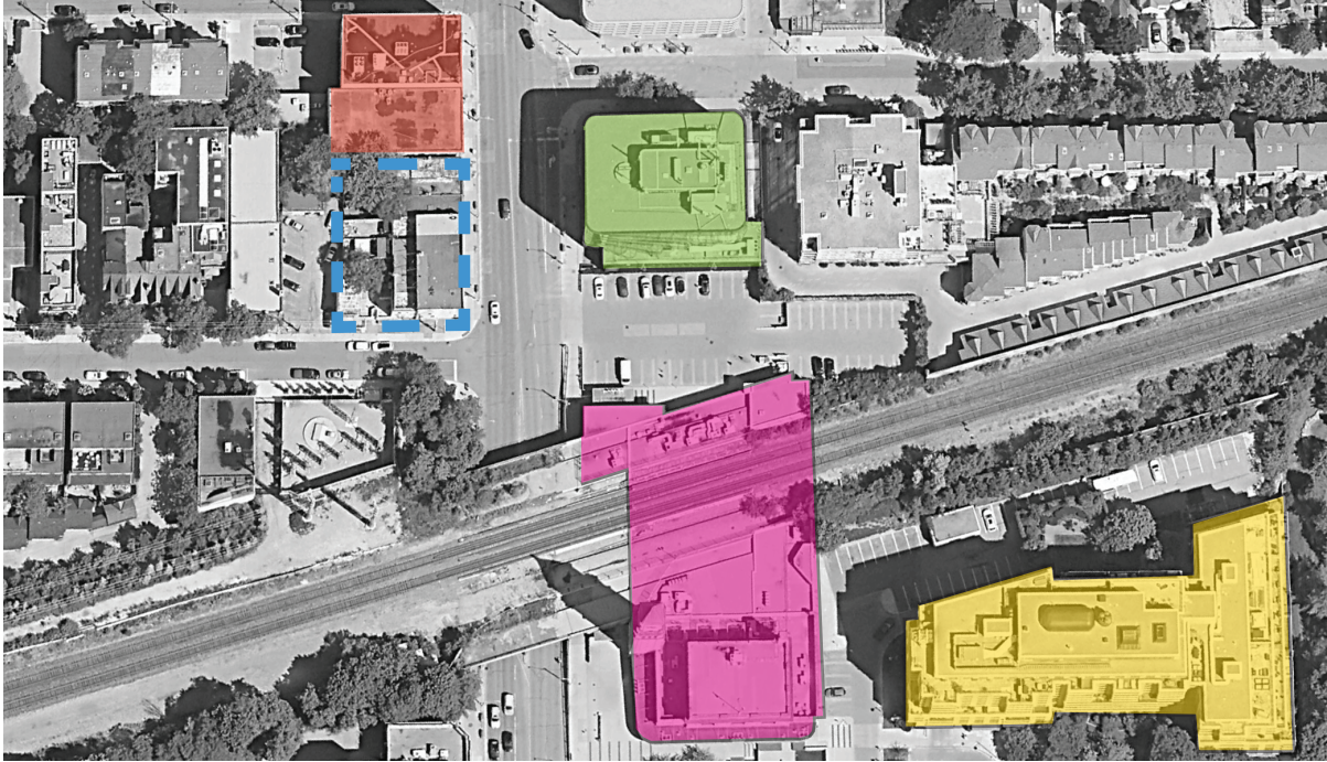
Context map of surrounding area, the Site outlined in dark blue.