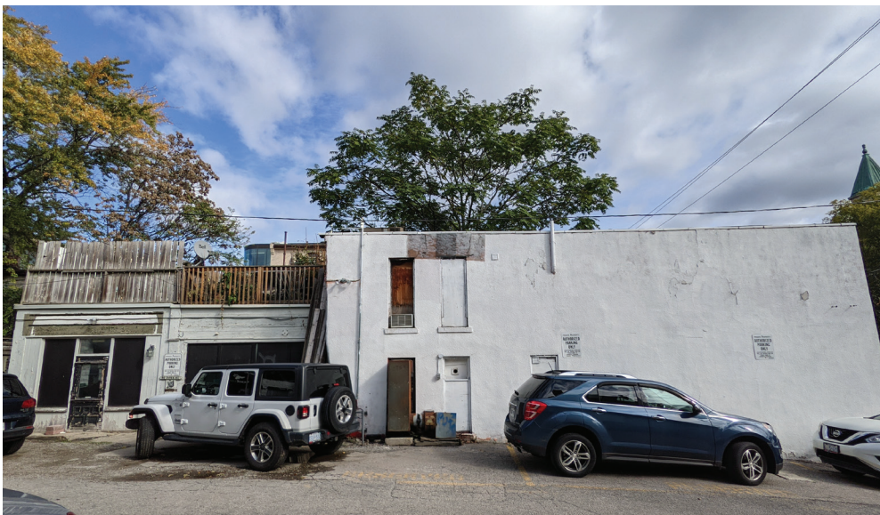
West elevation of Building C (ERA, 2021).