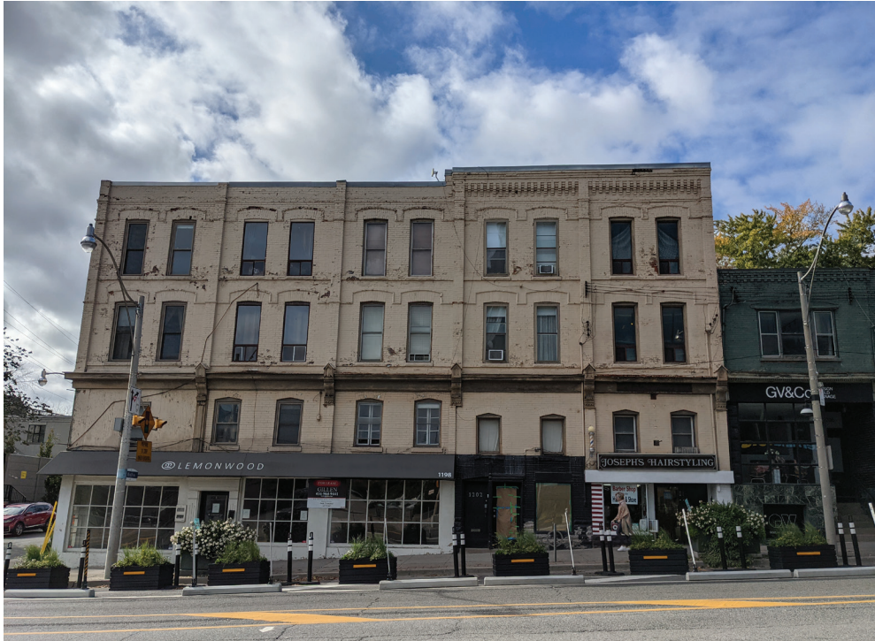
East (principal) elevation of Building A (ERA, 2021).