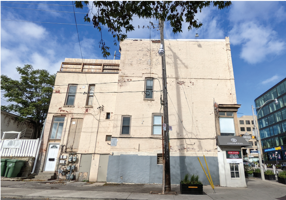
South elevation of Building A (ERA, 2021).