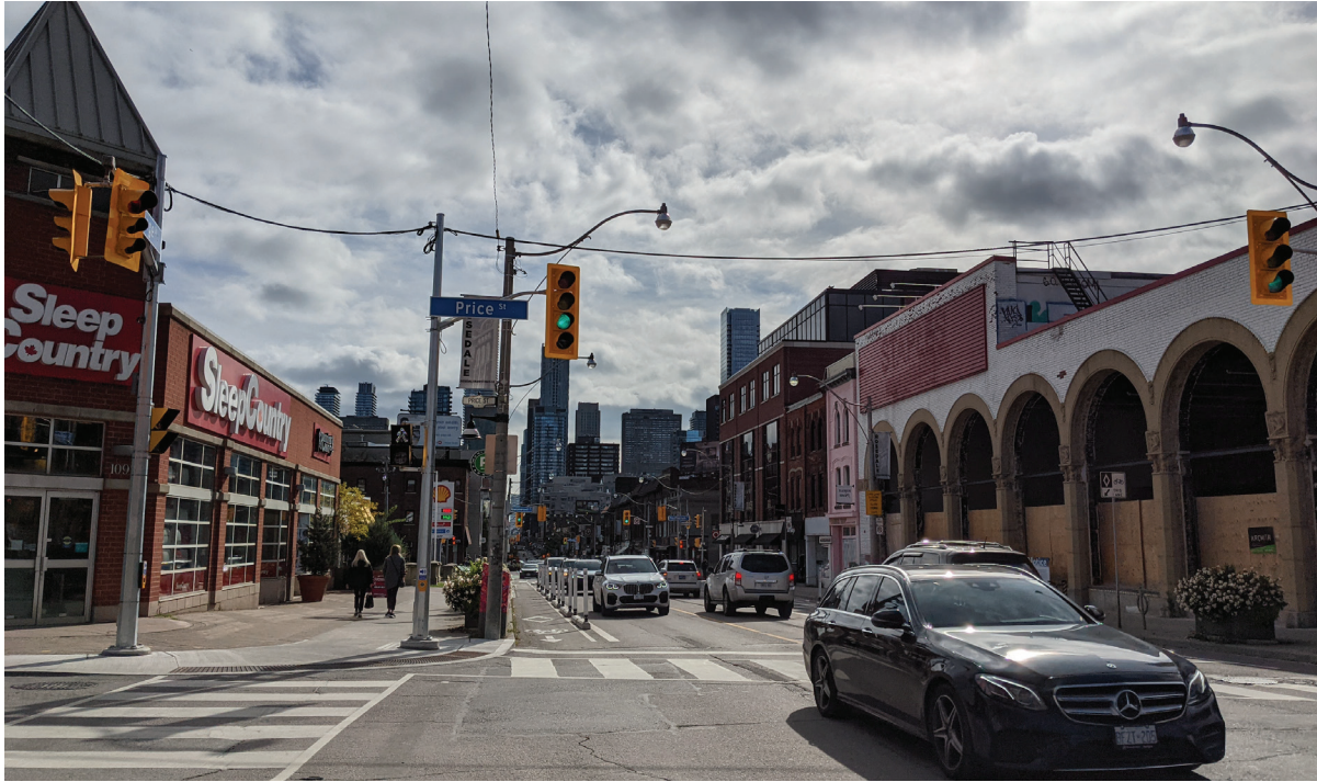
Looking south down Yonge Street from the northeast corner of Yonge Street and Price Avenue (ERA, 2021).